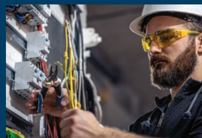
CAREER TECH - PAGES 7 - 12