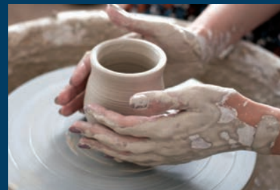
FEE BASED COURSES - PAGE 14-15