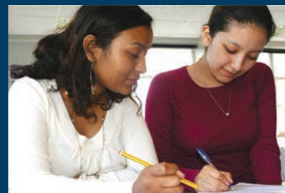
ESL - PAGE 5

The information printed herein regarding fees, class times and location is up to date at the time of printing. Please direct any questions about the courses or programs to the Main Campus/Pioneer Center located at 160 N. Barranca Avenue, Covina, CA 91723, or call (626) 974-4200. For more information, please visit our website at: www.tri-communityadulthood.org