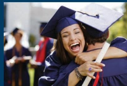
HS DIPLOMA - PAGE 6