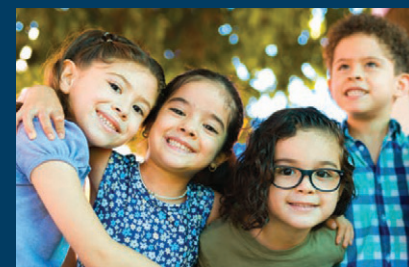
PARENT EDUCATION - PAGE 15